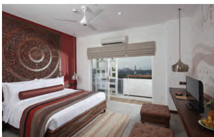
Jetwing Jaffna, Jaffna

of Trincomalee, lies the recently-opened, upmarket eco-resort of Jungle Beach. An ecological wonderland of tropical mangroves, pristine sandy beaches and bountiful flora and fauna, Jungle Beach provides the ultimate getaway retreat amongst nature at its absolute finest. Offering optimum privacy and seclusion amidst luscious jungle foliage, the resort features 48 spacious luxury cabins, modern in design yet crafted from indigenous materials to ensure a harmonious fusion with their environment, not to mention the most amazing ocean and lagoon views. And with their timeless natural authenticity comes the latest amenities to satisfy the demands of the modern era, luxuriously appointed with top-of-the-range entertainment systems, complimentary WiFi, king-size beds, private decks and an outdoor rain shower. Jungle Beach also features a spa, gym, swimming pool and an open-air restaurant offering glimpses to the ocean and signature dining options from traditional Sri Lankan favourites to international cuisine. read more