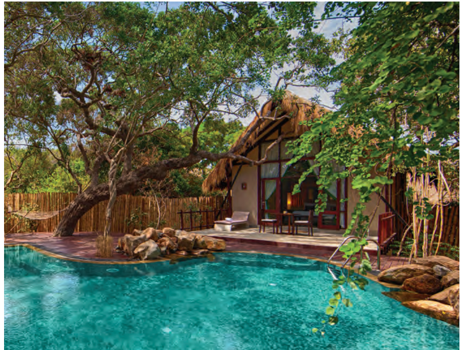
Jungle Beach, Trincomalee

In the heart of Jaffna, Jetwing Jaffna offers an authentic taste of traditional northern Sri Lanka. Guests are introduced to the style of the interior through the intricately shaped pattern of the façade, and then through the golden teardrop design that sits behind the reception desk. Public rooms are dominated by dark browns and greens, which hark back to the agricultural traditions of inland Sri Lanka, Kandy, and the Cultural Triangle, but with the refined touches of the cosmopolitan city that Jaffna is quickly becoming. The bar is shaped out of carved wood, with red material tiles across the ceiling, and large dark-framed windows that look out through the intricate carving that dominates the façade. The restaurant incorporates this enormous carving and rustic colour scheme. Low wooden benches, which have a distinctly antique feel, add character to the high-ceilinged, exceptionally modern room, as does the food, which refines the popular flavours of the