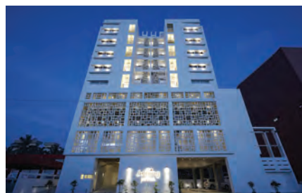
Jetwing Jaffna, Jaffna