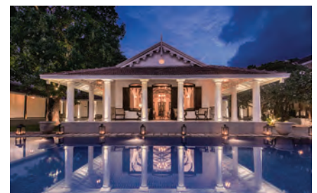
Uga Residence, Colombo